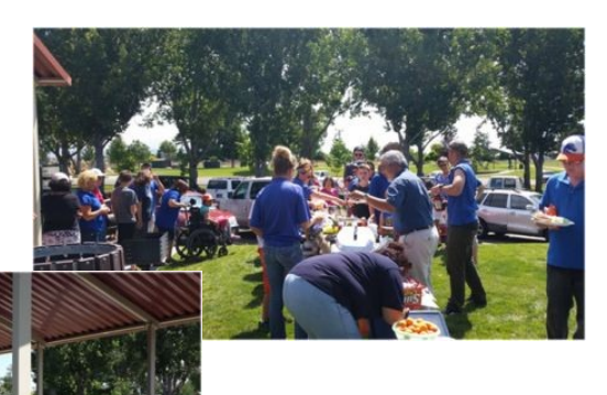
July 3rd BBQ

for the BBQ allowed for a great afternoon of food, folks, and " FUN ".